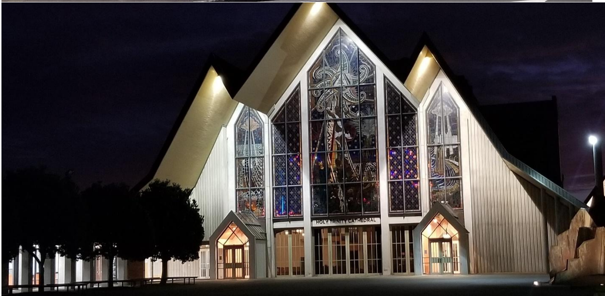
Two views of Trinity Cathedral's Front entrance