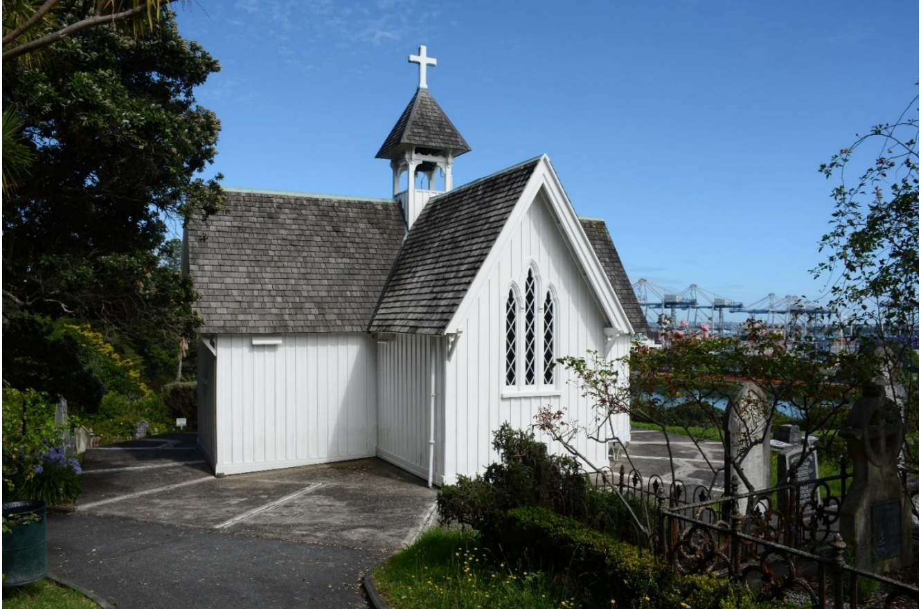
St. Stephen's Chapel, Judges Bay Auckland New Zealand

Calling all Youth at St. Thomas - come join us!