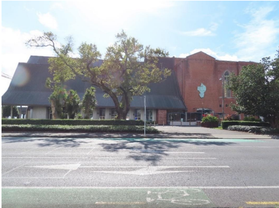
Side view -Pierre Reinhard

Holy Trinity Cathedral is a bright modern church built to be a multi-functional space. The cornerstone for this newer cathedral was laid in 1957; the Chancel was completed in 1973 and was used as the Cathedral until the work on the Nave was completed in 1995. New Zealand architect, Richard Toy, designed the Nave.