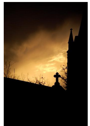
Photo by JMENKING Church Silhouette Free Photo Download | FreeImages

Audits, Bookkeeping, Financial Stewardship