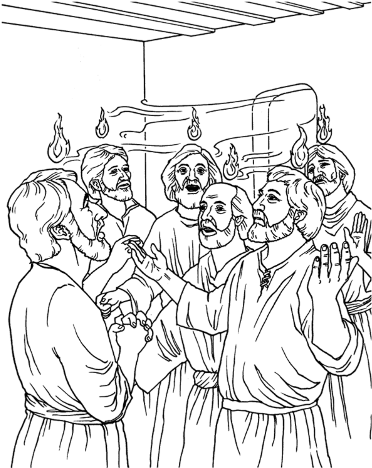
The Day of Pentecost Acts 2